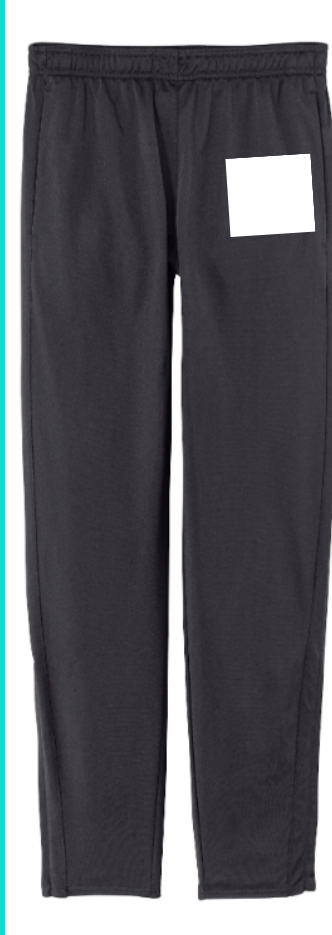
PANTS LEFT FRONT