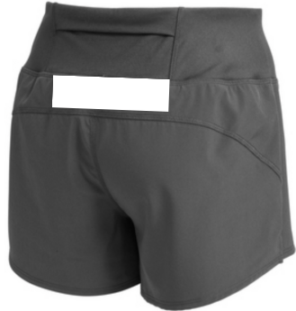
UPPER SHORT BACK